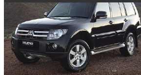
Mitsubishi Pajero NS