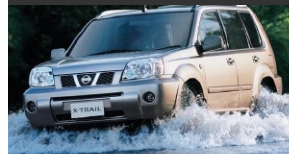
Nissan X-Trail T31 / Pathfinder R51 / Dualis