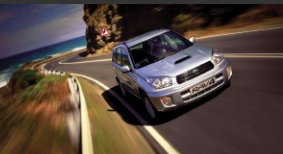
Toyota Rav 4