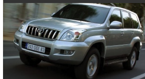
Toyota Prado 120 series