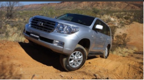
Toyota Land Cruiser 100 and 200 Series