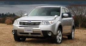
Subaru Forester 2008+